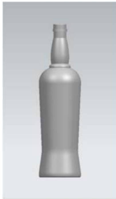
No.2 3D drawing