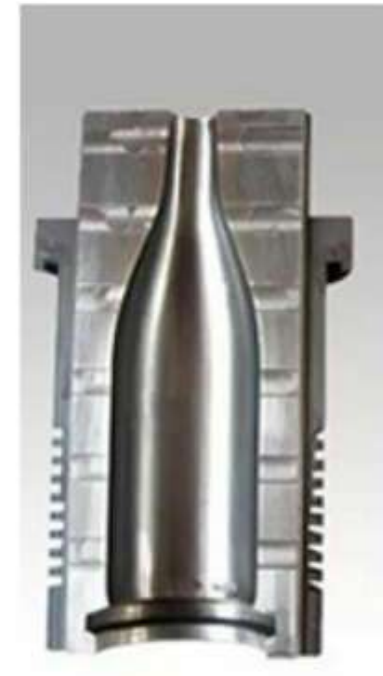
No.3 Make mould